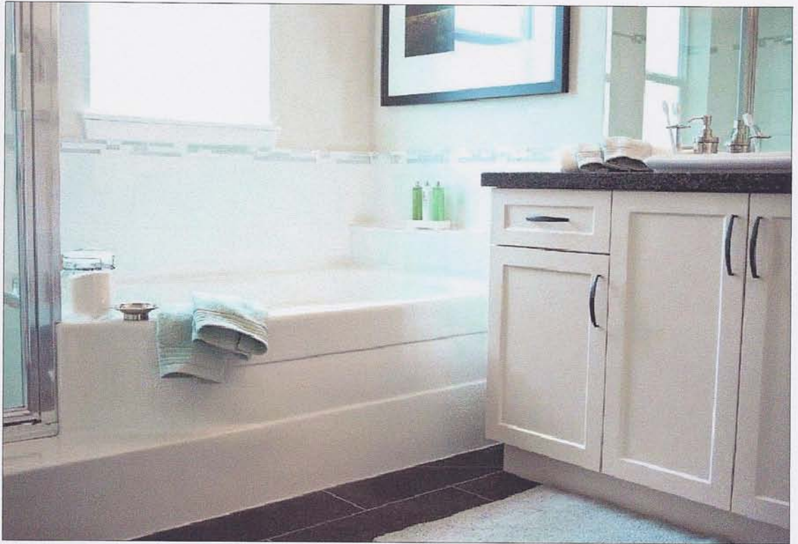
Master bedroom ensuite bathrooms feature tubs for soaking as well as shower stalls.

Homes start from $499,900. Visit www.coast49.ca for more information.